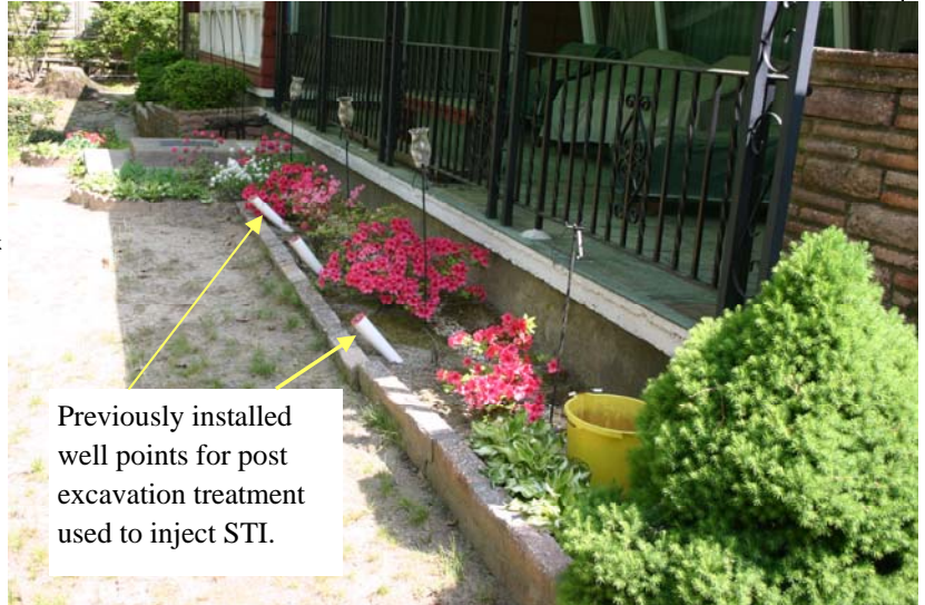
Previously installed well points for post excavation treatment used to inject STI.